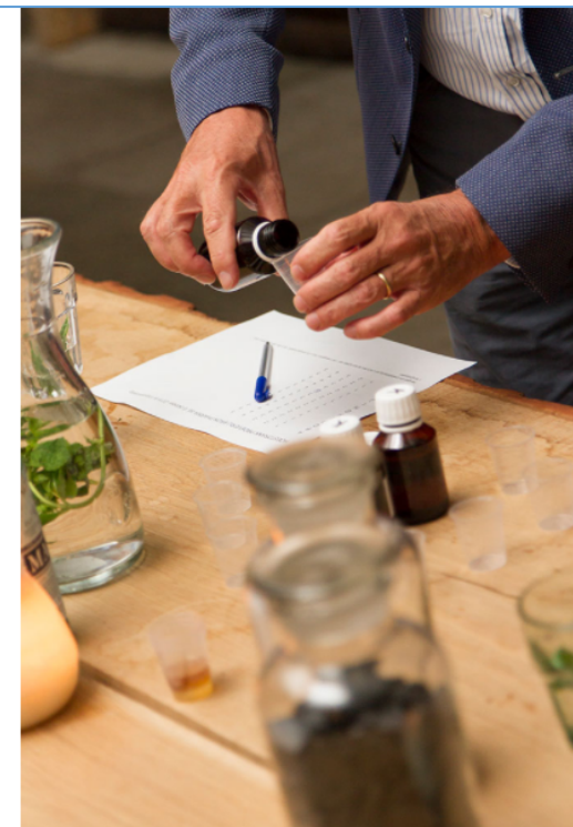
Facilitated by Gorter Advisie

BrOnPharma Oud-Hollands keelelixer is uit voorraad verkrijgbaar bij een groeiend aantal apotheken. Op onderstaande kaart vindt u alle voorraadhoudende apotheken. Staat uw apotheek hier niet tussen? Geen nood! Ook uw apotheek kan de producten van BrOnPharma bestellen en binnen 24 uur in huis hebben via hun farmaceutische groothandel. Ook kunt u onze producten bestellen via onze eigen webshop ( http://bronpharma.24uurshop.nl/ ).